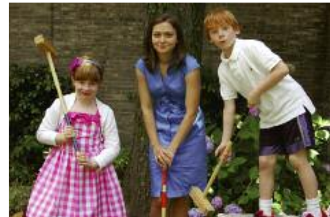
Young croquet players enjoy the spacious new lawn of the Hoyt Garden at the second annual Pennsylvania Society picnic at Anderson House while their elders (above) relax on the east terrace.